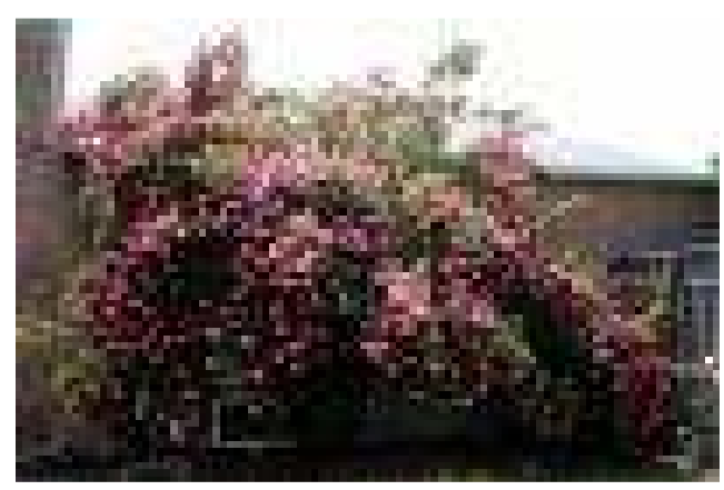
Examples of garden tours, "extreme makeover" - Graber's John Cabot on the right

and subscribing, paying on the spot by internet Paypal deserving a line of its own, and the introduction of the paywall concept (i.e. apart from front page, no access to the "inner" site where the annals past and present of the CRS are found, unless one is a paid subscriber.