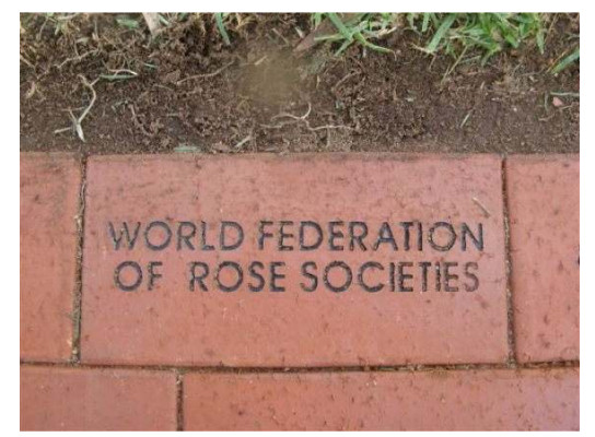
WFRS brick paver donation to the sculpture fund

on the world convention to be held in South Africa. For me it was most fortunate that my visit