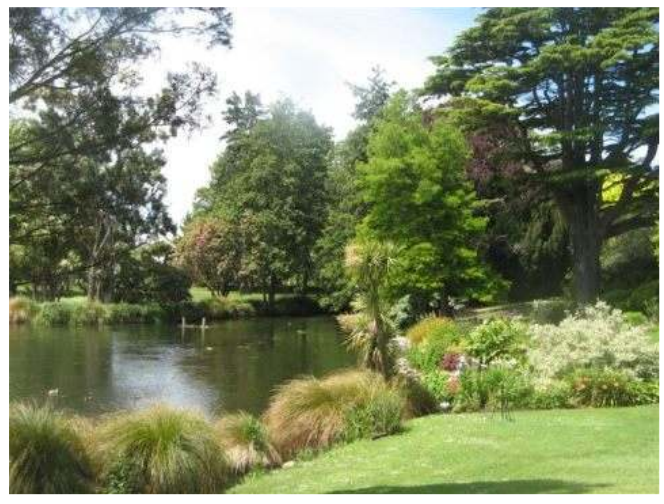
Heritage Roses at Hagley Park, Christchurch