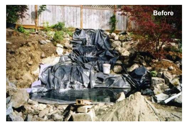
What a "makeover" is capable of achieving

and subscribing, paying on the spot by internet Paypal deserving a line of its own, and the introduction of the paywall concept (i.e. apart from front page, no access to the "inner" site where the annals past and present of the CRS are found, unless one is a paid subscriber.